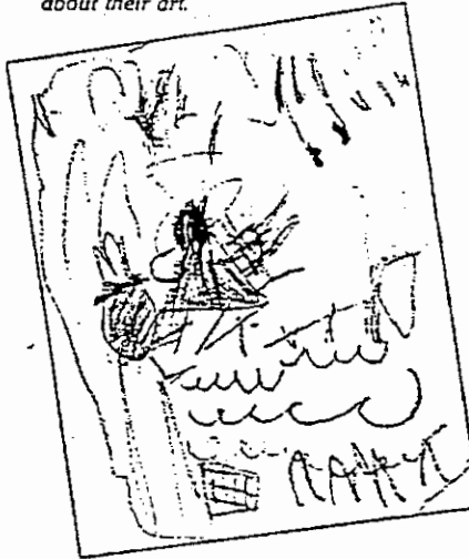
Figure 2. The symbolism of young children's art is usually not obvious, so we can rely heavily on the artistic elements in talking with younger children about their art.

"How hard you worked to include the fire trucks, the house, and the fire!"